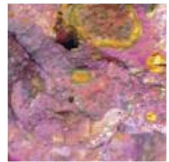
Concrete tested with pink and yellow gels showing both beginning and advanced stages of ASR.