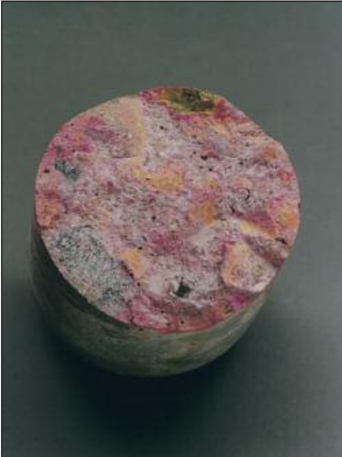
Concrete Core Showing Advanced ASR