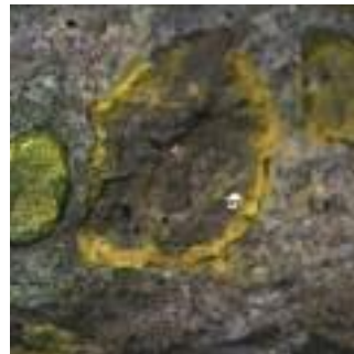
Concrete tested with yellow gel only showing beginning stages of ASR degradation.