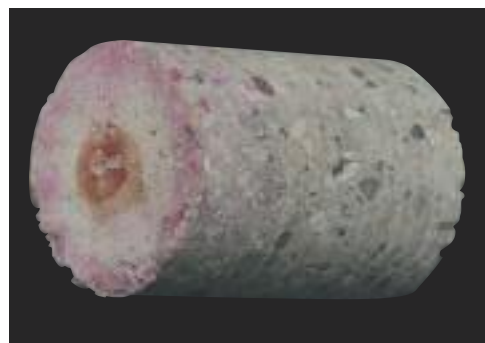
Concrete Core showing uncarbonated area at the left

Care should be taken to prevent drilling and coring dust from contaminating the surface to be tested.